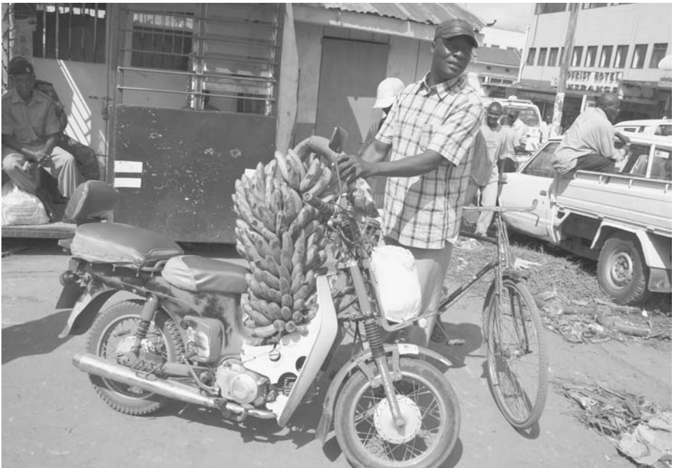
A banana seller in Kampala, Uganda.

The most common kind of food sold on the streets of East Africa is starch. This calorie-laden kind of food is provided by starchy vegetables, legumes, fruits, and grains. Plantains, cassava (manioc), potatoes, beans, corn, and other grains are usually boiled into mushes or stews and served plain with some form of bread, especially Indian chapatis. When meats are affordable, goat and chicken are the most commonly eaten, sometimes in stews but also grilled. On the coasts and lakes, fish are very common, often grilled and made with spicy sauces. Some of the East African food traditions value lots of spices—Mozambique, for example—others do not. Whatever the specific food, it is usually sold by vendors who set up small stands or stalls near markets and on city streets where working people can get breakfast or lunch. Even along roads, travelers will see small stands selling mainly local produce or snacks such as roasted peanuts. Most of the sellers are women who also prepare the food at home. Vending is a major source of income for many families.